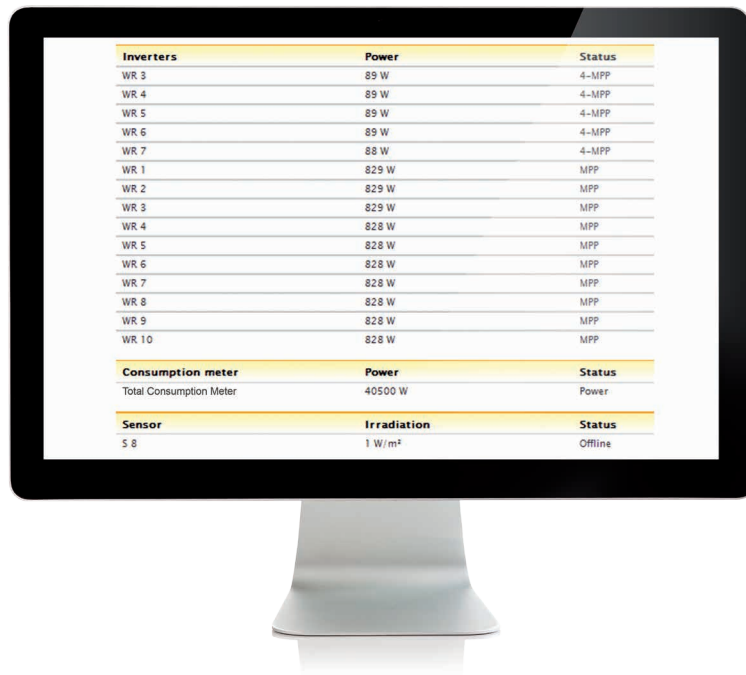
Daily consumption tables from the connected appliances.

Current transformers (CTs) are used to record the measured values and send the values to the Solar-Log™ Meter. The data from the connected appliances can be displayed accordingly in a daily consumption graph or table.